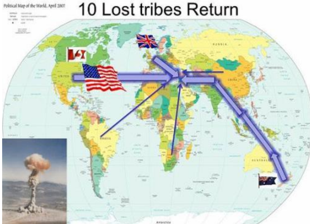
The remnant of the 'House of Israel' returns after' World War 3