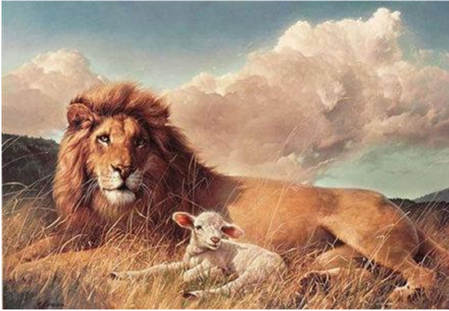
'the Spirit & the Bride say Come' 'Even so, come Lord Yeshua'