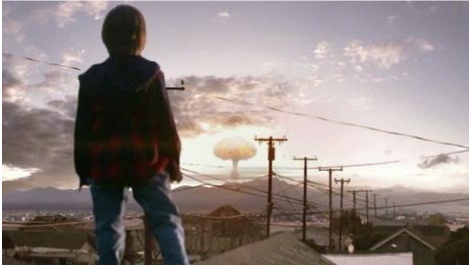
Land of the Rising Sun - A taste of things to come.