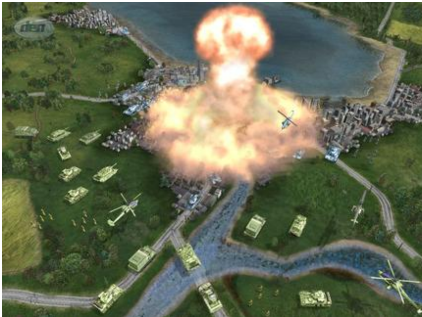
Small 'dirty Nukes' in home town USA.

This game movie ends with a quote from Abraham Lincoln, a nation divided will not stand. Of course the inference is that the Gamer has to Unite America (under Rome or Babylon?). In any case there is a nation that is divided and has already fallen. That is, Israel, split into two houses. Soon those two Houses will be drawn together, after America sits in dust and ashes.