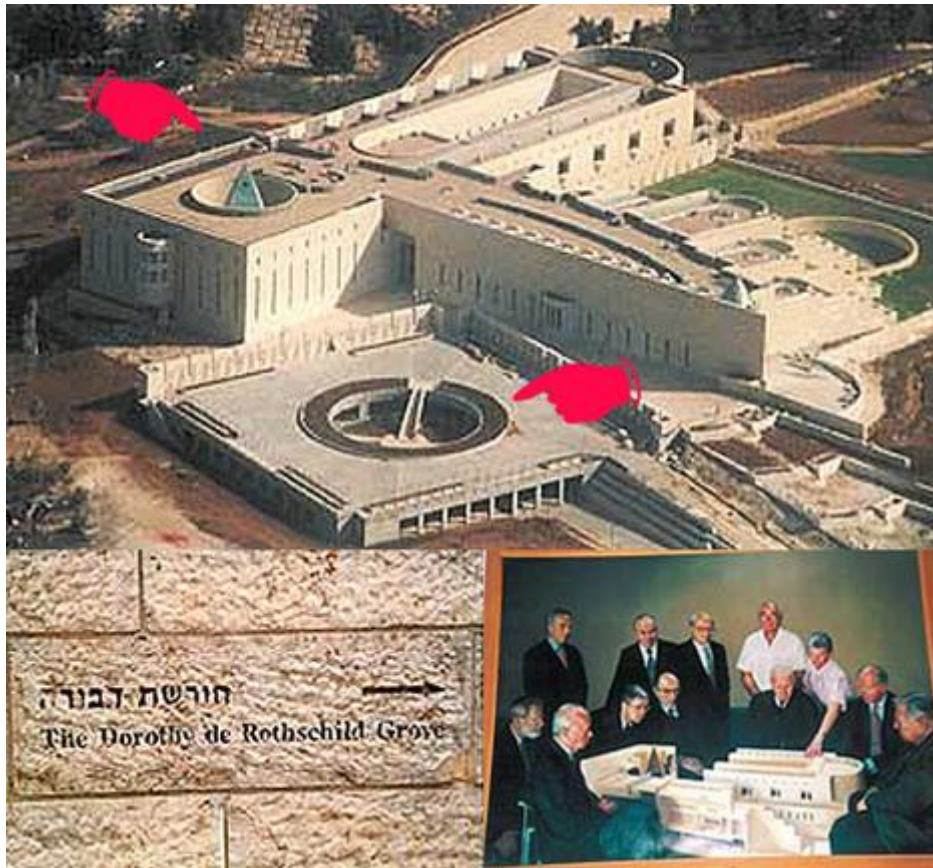
Edom 'Court' Red Handed

There is a car-park in the shape of a square with a circle (Squaring the Circle) and a ladder leading downward to a walk way over a cross. The entire building is crammed pack full of gnostic esoteric imagery. Do some searches on google, under 'Israel Supreme Court', you wont have to look far!